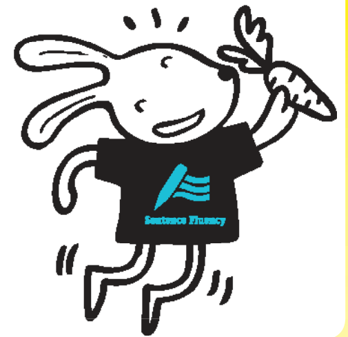
I've Got It!