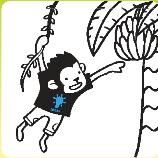
On My Way