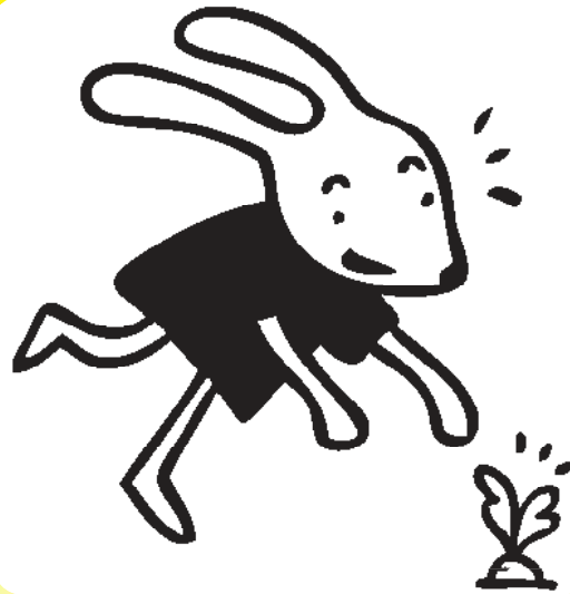
On My Way