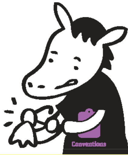
On My Way