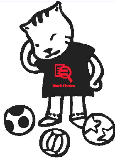
On My Way