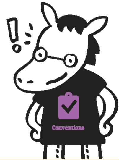
I've Got It!