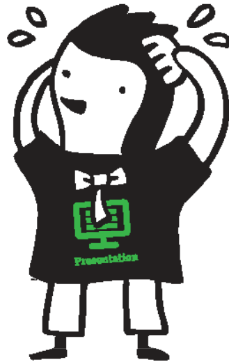
On My Way