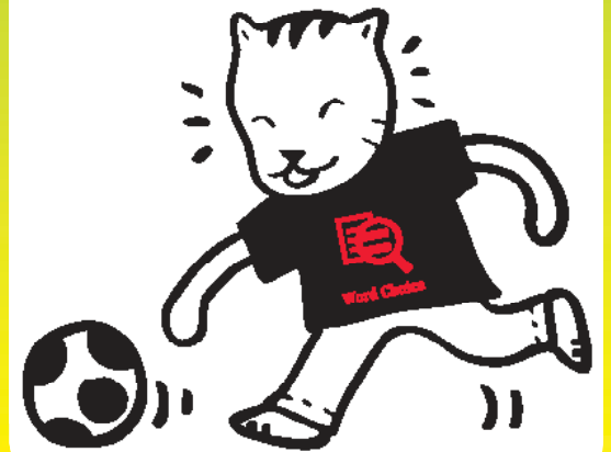
I've Got It!